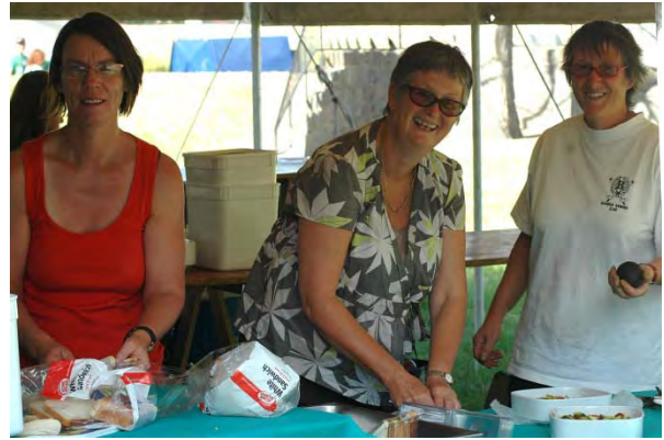
Women at work in the catering tent