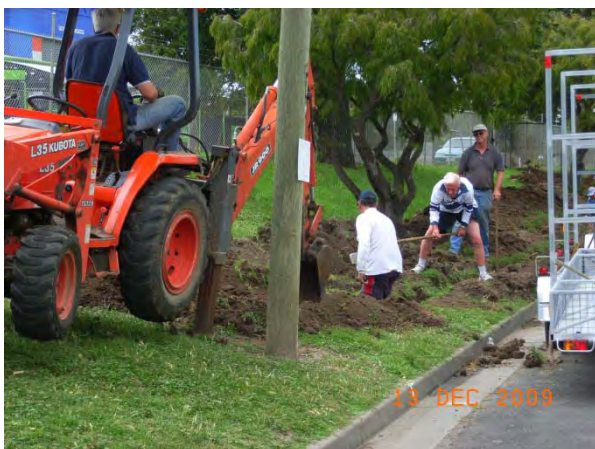
'Men at work' installing the fire service.